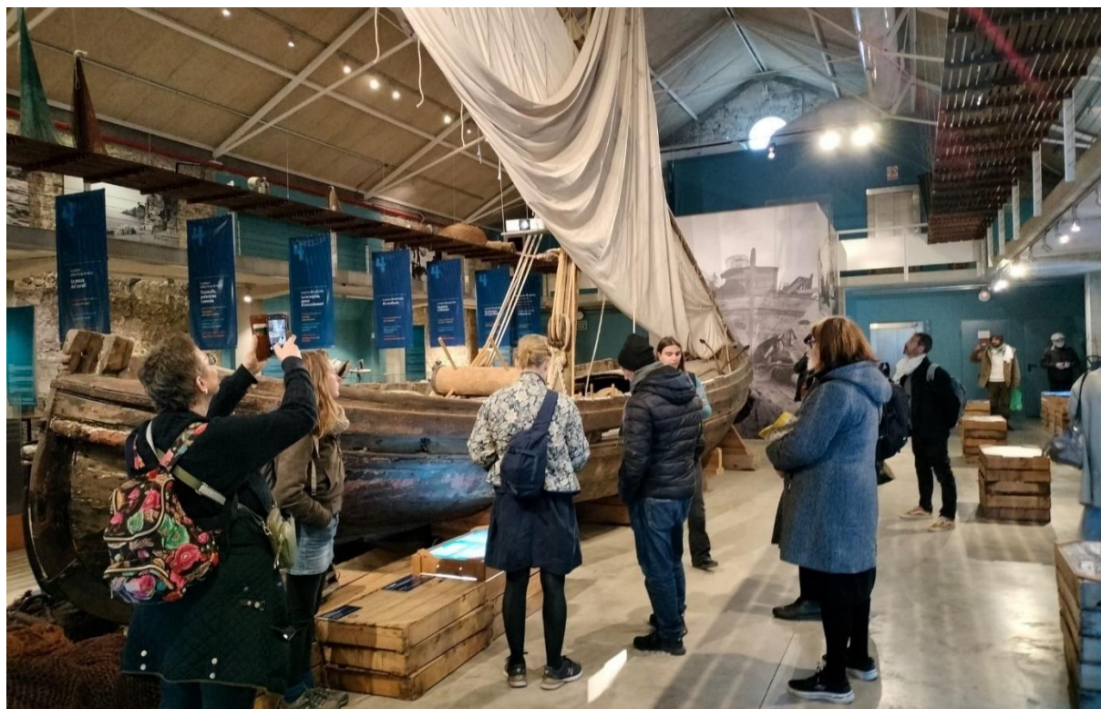
An Erasmus+ course lesson at the Fishing Museum in Palamos, Spain, during the Eco-literacy course, March 2024, provided by the course provider, Learn-To-Teach.

The same applies to the 14 other community centres, which are run by volunteers, where we also want more citizens of different ages and social and cultural backgrounds to be included, and who want to use the premises in the community centres. We also hope to be better to open the sports halls, for new people. We also have several smaller libraries around the municipality, which would also benefit from some more life and initiatives from volunteers having small events there.