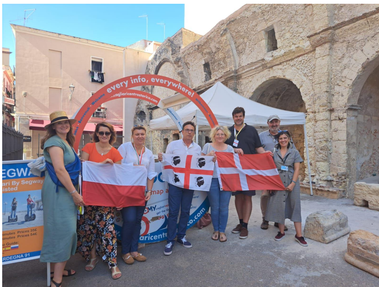
From the second partner meeting in the Micropolis project, October 2023 in Cagliari, Sardinia

Based on our work with the Micropolis concept, we would therefore recommend that we continue to consider the European dimension in the local work. Partly because it contributes to local cohesion, but also because volunteers and employees in the municipality can have a common third to be together about - together we can learn and be more inspired. This is a sustainable way to create the strong local communities that the Micropolis project is about.