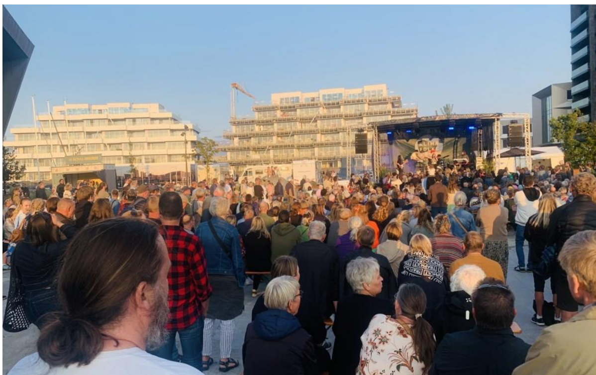
People at the scene of the People's Climate Meeting, august 2023

The Volunteer Centre Middelfart has during the spring 2024 in cooperation with a group of social voluntary associations planned to take part in and have stalls and activities in a bigger event about sustainability, like the yearly People's Climate meeting in Middelfart, august 2024. 2