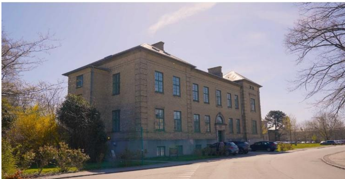
Frivilligcenter Middelfart (Volunteer Centre Middelfart)