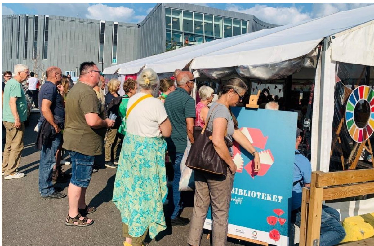
People visit the stall of the Library at the People's Climate Meeting, august 2023

The activities are organized in collaboration between Middelfart Municipality, Volunteer Center Middelfart, and selected member associations.