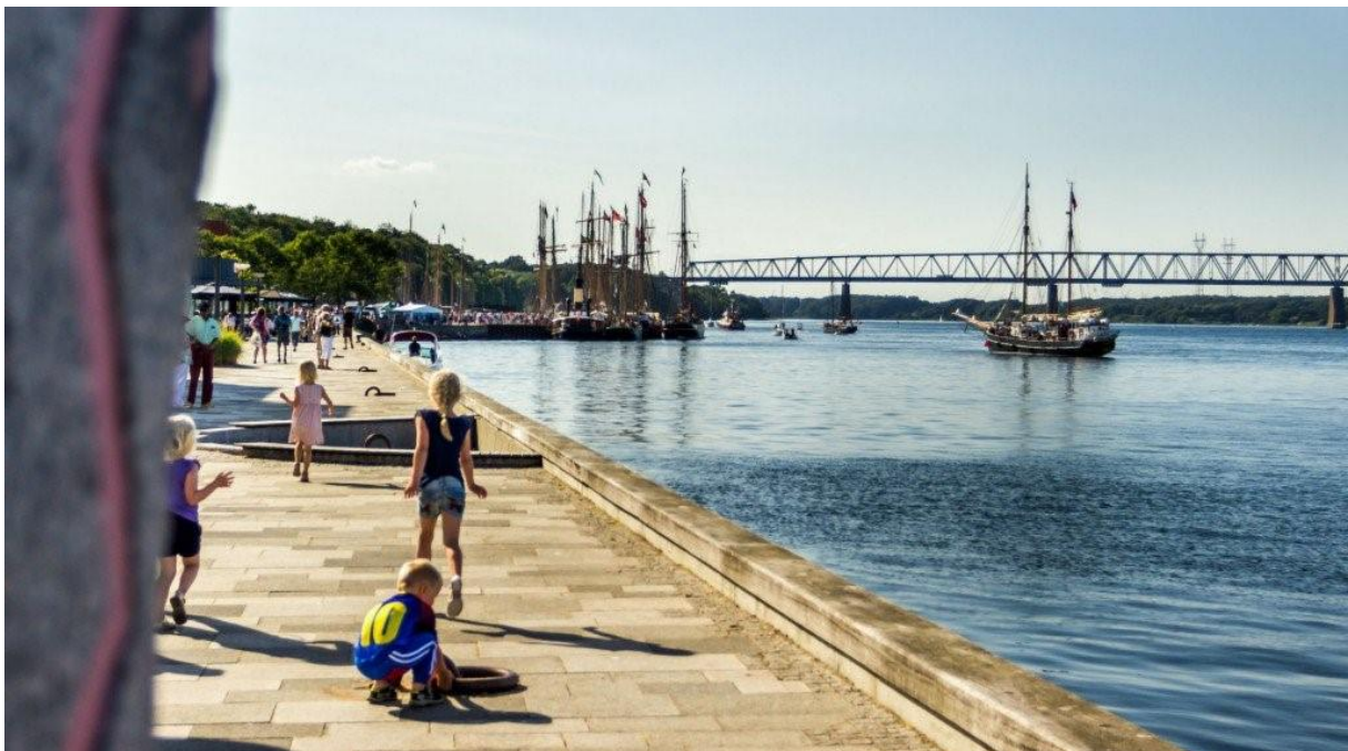
The waterfront in Middelfart