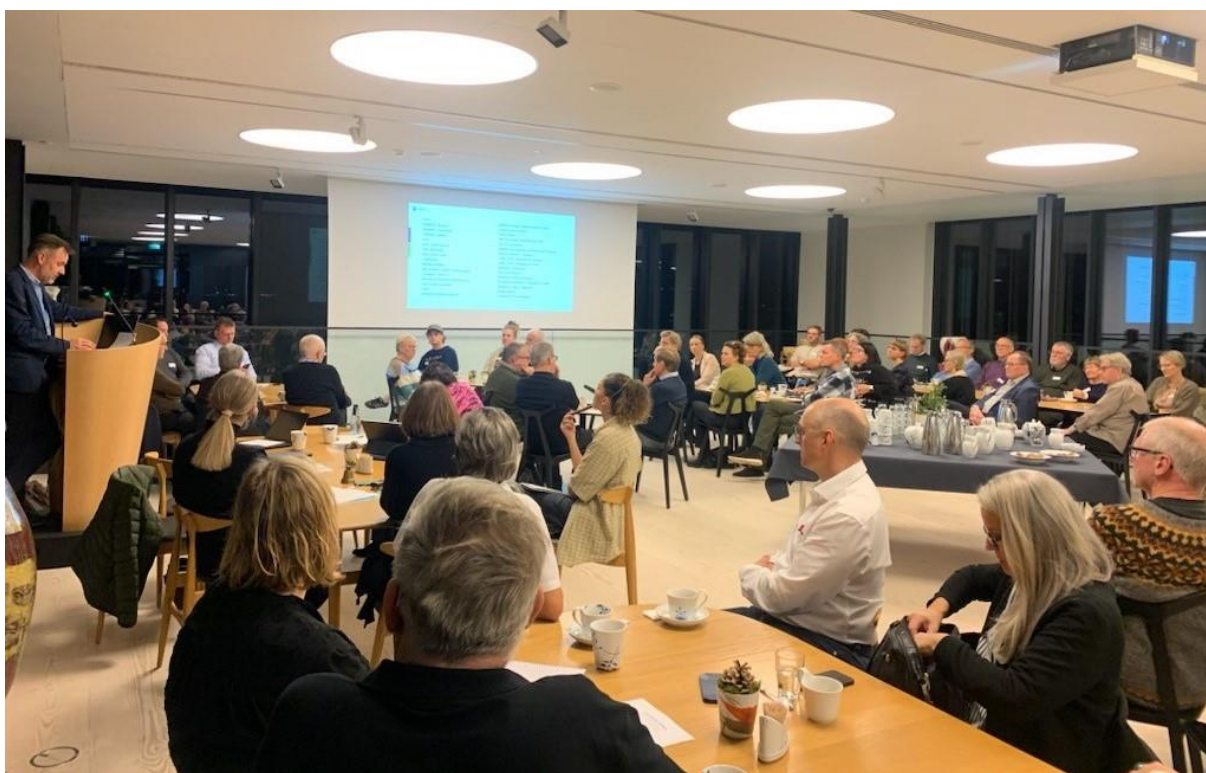
Cultural workshop at the Clay Museum, November 2023

We made invitations directly to all the associations in the cultural field that we knew of. We also invited individuals, who work with culture - e.g. visual artists. Our wish was to get many people involved, so that we could have a broad and diverse conversation about culture with many different perspectives.